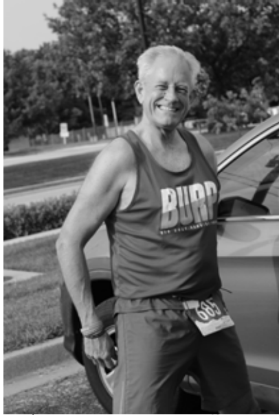
"That's why you eat a taco."

Presented by KC Running Company in Martin City, the Taco Mile requires participants to eat a taco before running each of four quarter miles. Running in waves of 15-20, each wave was called to the starting line carrying a taco. When the starter said go, competitors could begin eating their taco but could not begin running until the taco was finished. The runners seemed to enjoy themselves and the tacos provided by Dos Oros of Martin City.