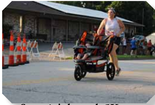
Snoozin' through 5K