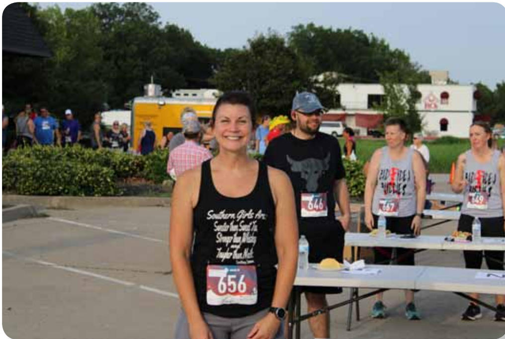
Southern Girls Eat tacos, Too