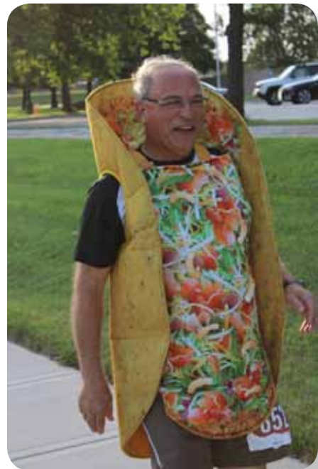
Mr. Taco Carries on