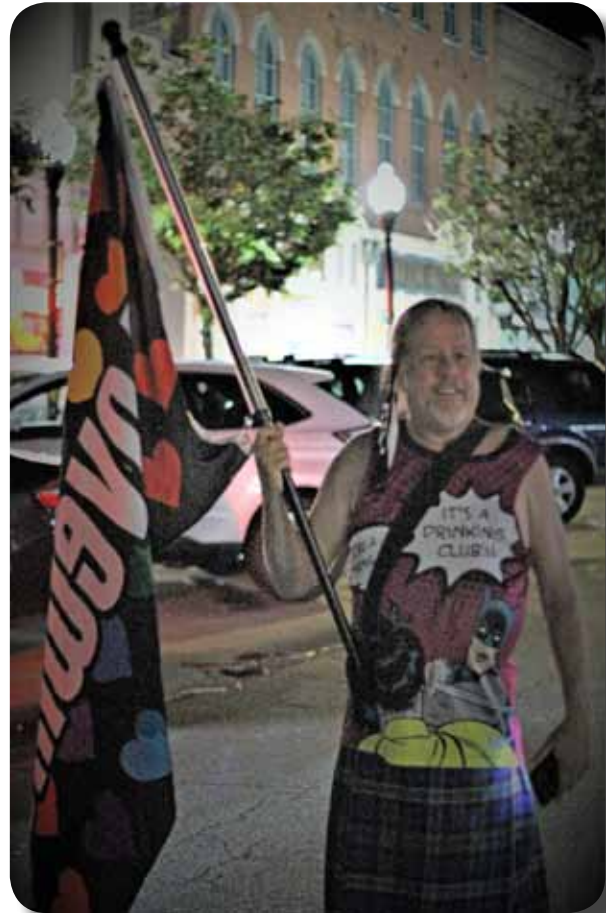
Every year a guy shows up with a flag in his kilt.