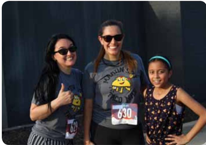
Wave two Speedsters