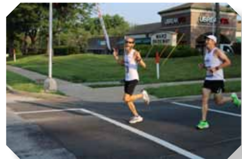
Second & Third Place