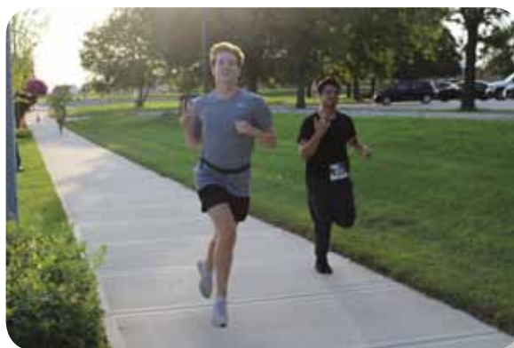
leaders of wave Three