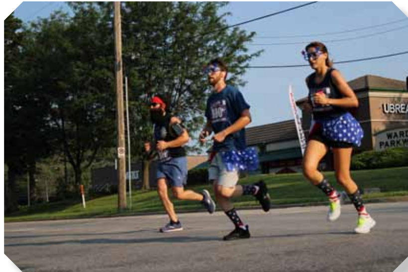
Tutus, & Socks