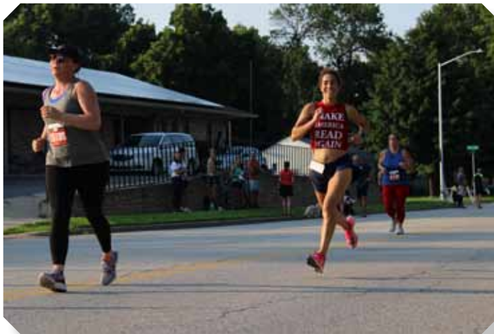
Running & Reading