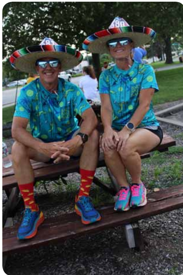
The Sombrero Team awaits their Time