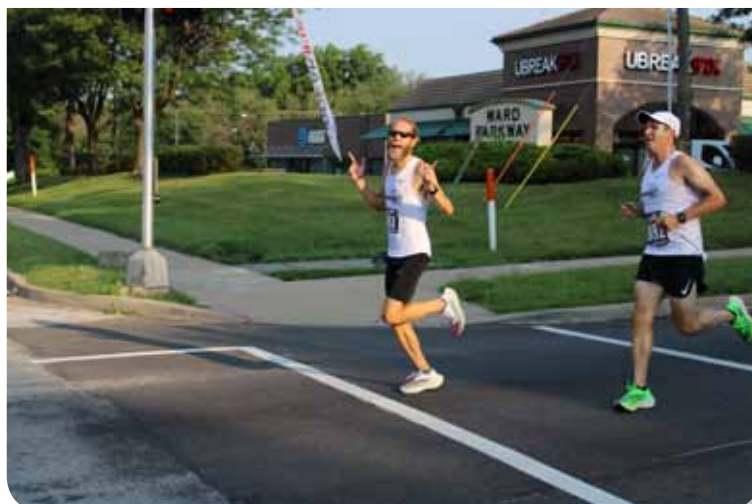
It's All Taco Fun!