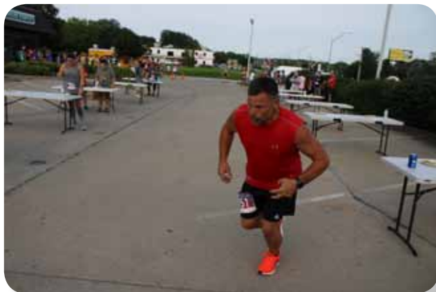
Wave two leader heads out again