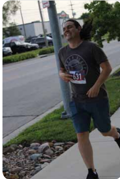
The ecstasy of Taco running