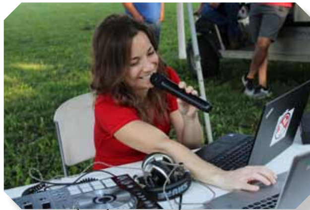
the always smiling Race Announcer