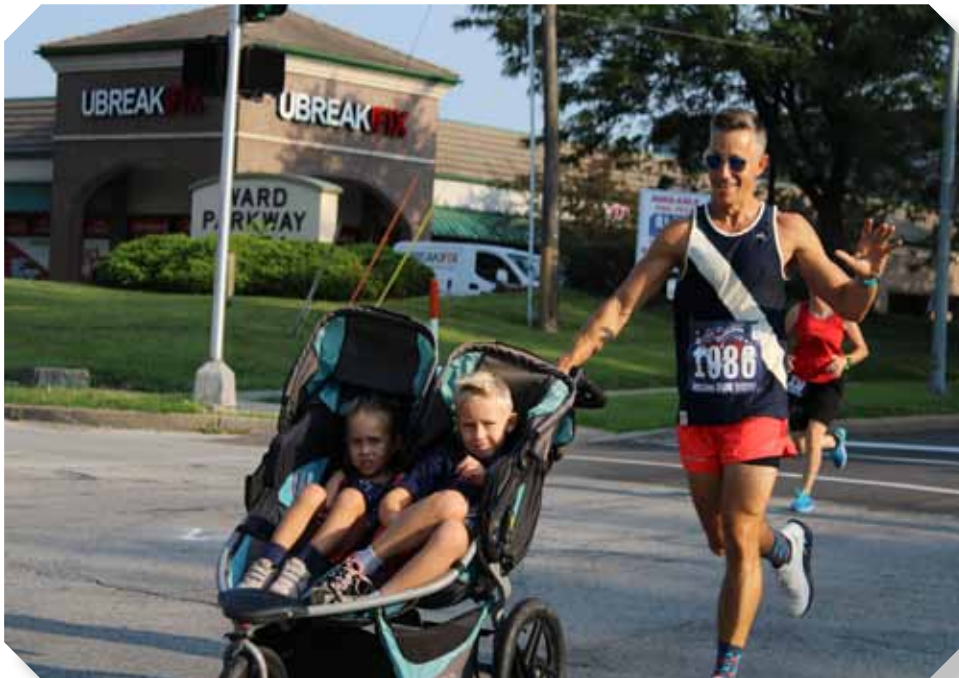
Dad Having Fun: Does all the Work