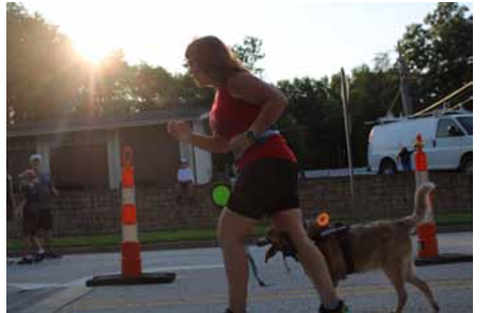
Nobody's doggin' it in the 5K