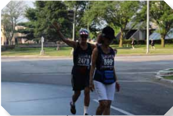
Avoiding the spray