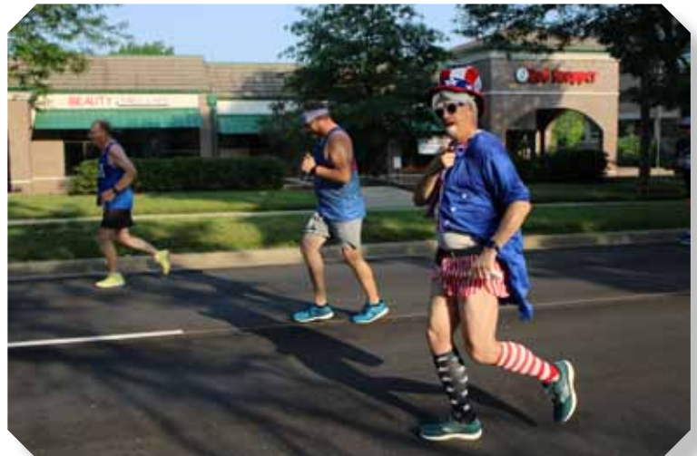
Uncle Sam on TheRun