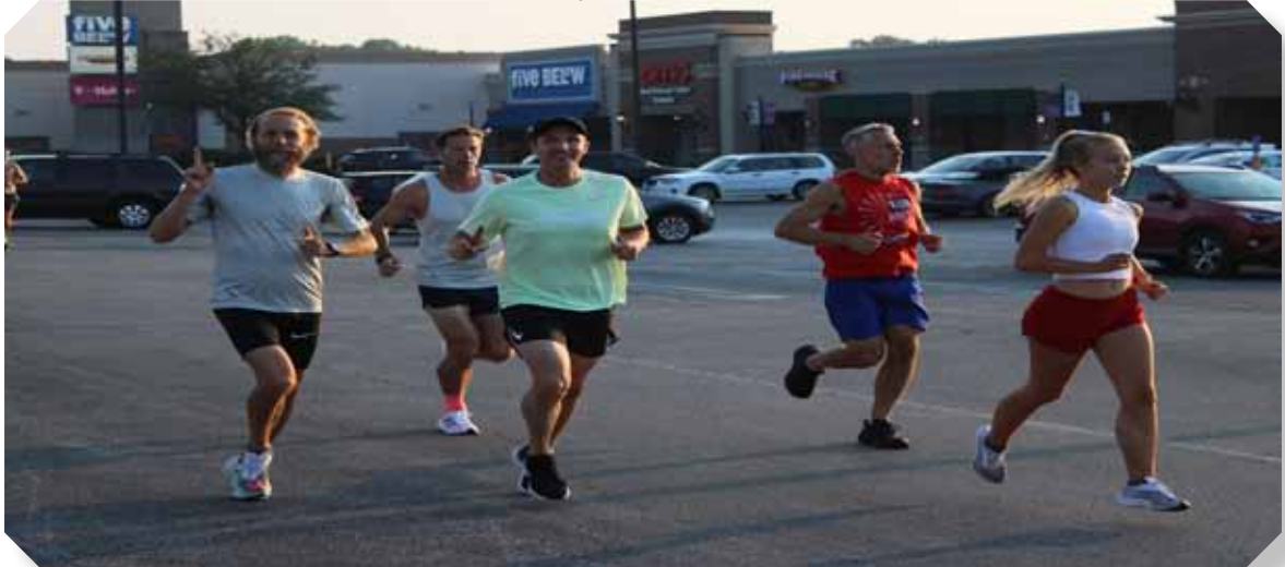
headed to the start