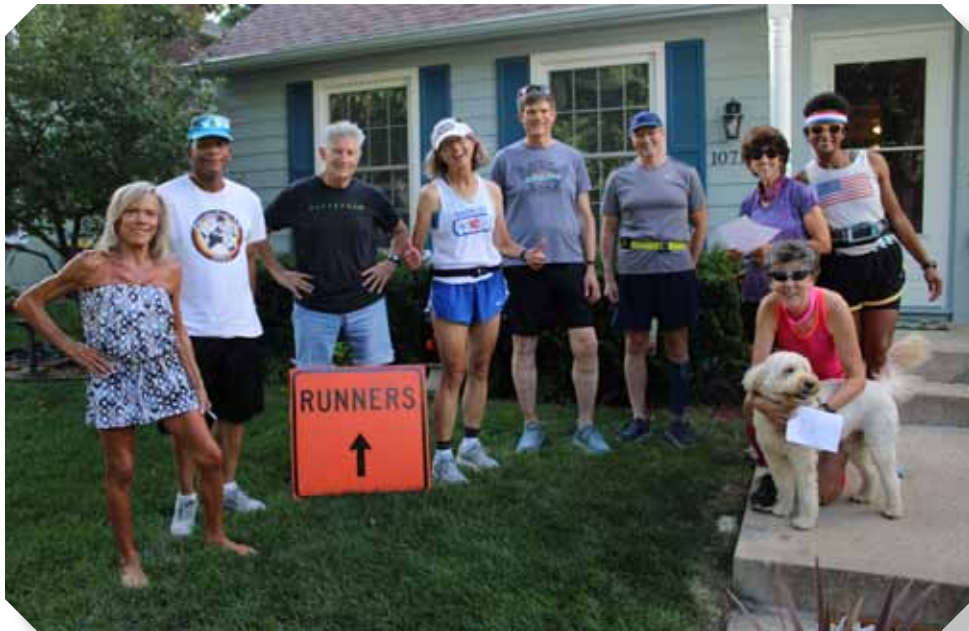
Runners ready to work up a Sweat