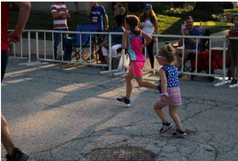
... and Many more races to come...