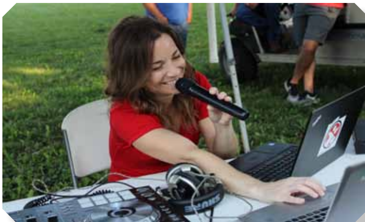
The always smiling Race Announcer