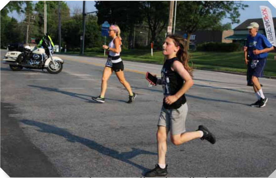
Almost as tall as the cell Phone