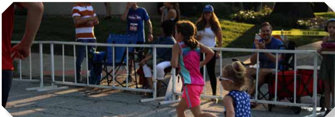
... And many more races to come