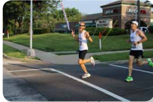
Two competitors and Three groups