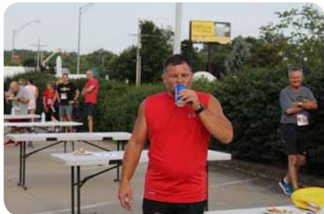
A spoonful of Bud Light helps the Taco go Down