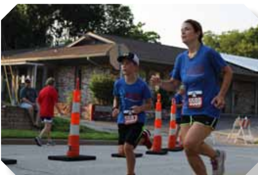
Mom and Son Focused On the finish