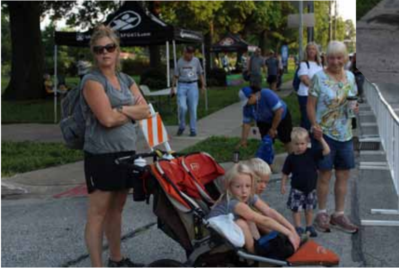
Waitin' for theRunners