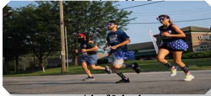
4th of July glasses,