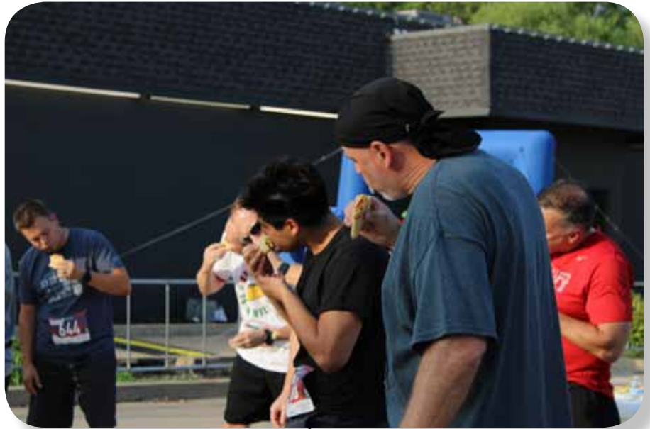
Wave three start