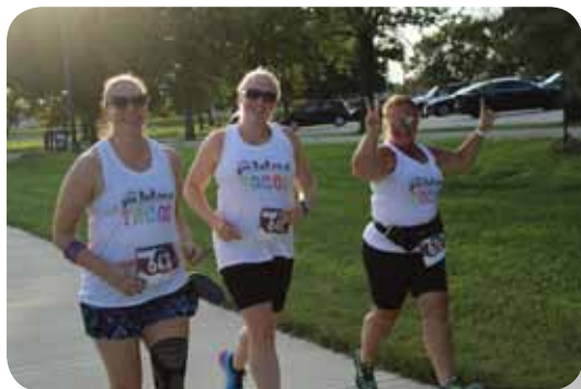
Being "had" in Wave three