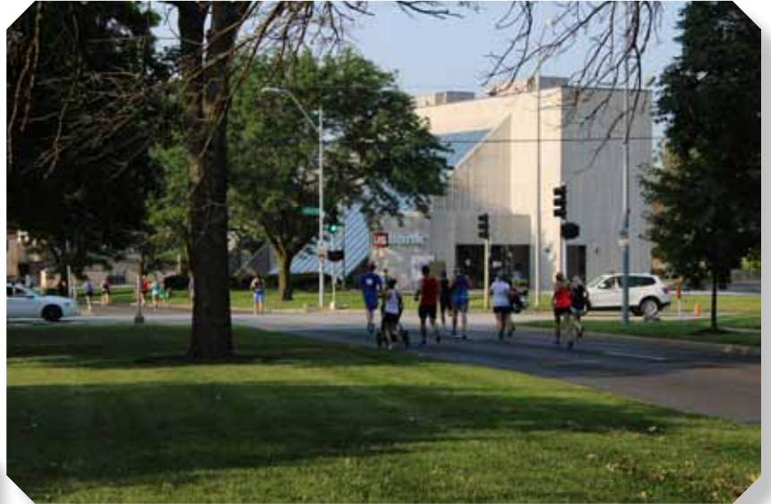
Banking on Running