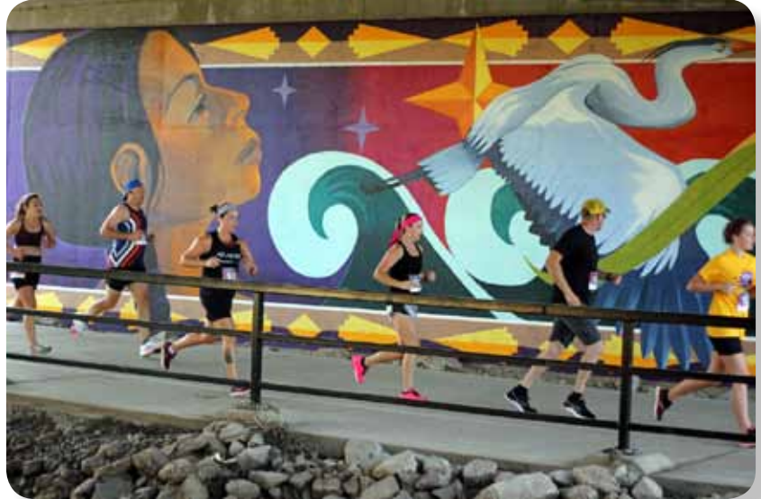
The runners went by a mural just after the start. The mural was drawn by students and young adults with VanGo., Inc.

The REXY Run 5K and 10K is hosted by BabyJay's Legacy Of Hope, a 501C based out of Lawrence that helps families with children who are fighting cancer. It helps offset the extra expenses families have that are not covered by health insurance. The run starts at Broken Arrow Park and swings through the Baker Wetlands.