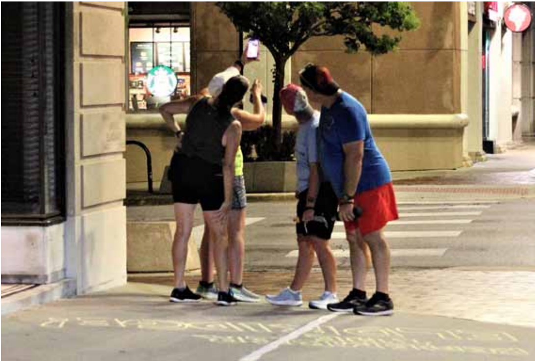
ChalkingSelfie: Rounding the last corner before the finish, this group stopped to look at the sidewalk graffiti and decided to have a group selfie.