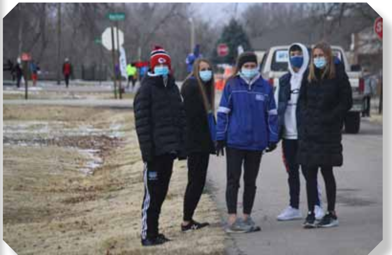
Young Helpers Keep Their Elders Running