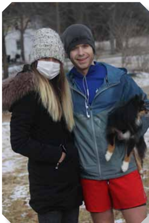
Did he carry the dog for 13.1 miles?