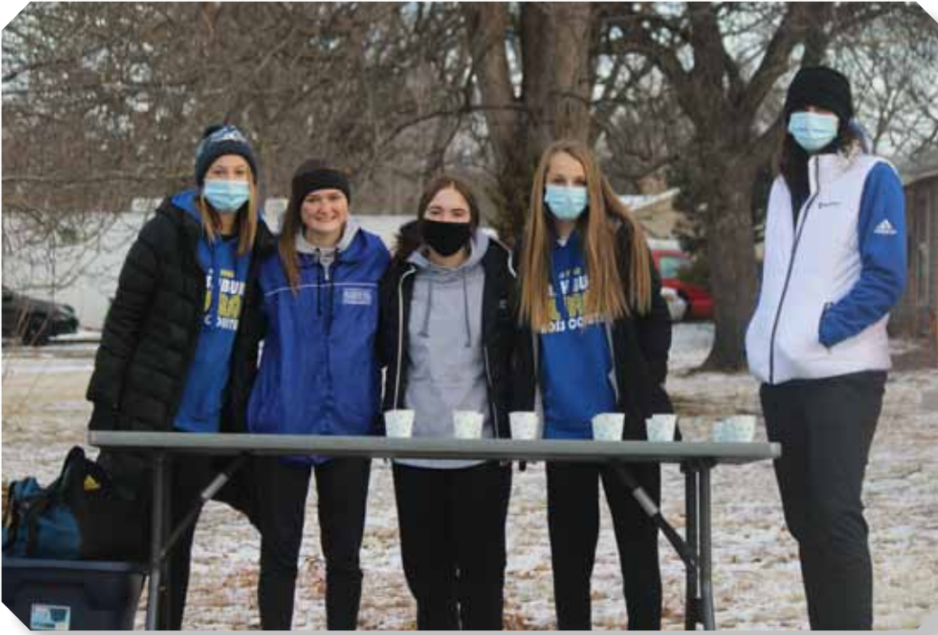
Runners from Washburn Rural help at Aid Station