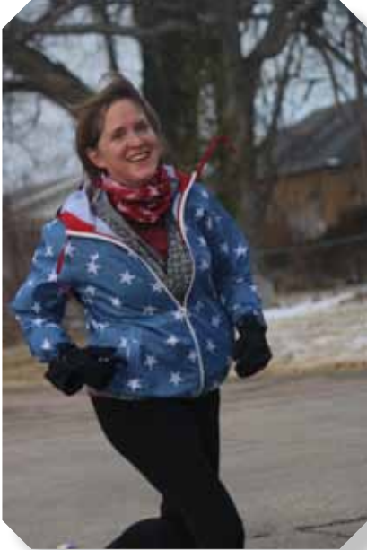
Ad Astra Per Aspera