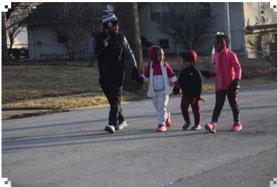
Family Relay Team -- Who wants to anchor?