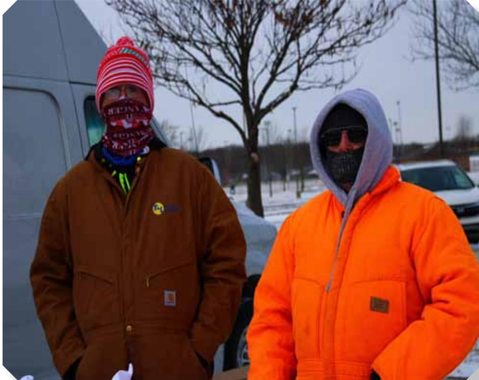
Minus two Degrees, Minus eighteen Degrees wind chill !!