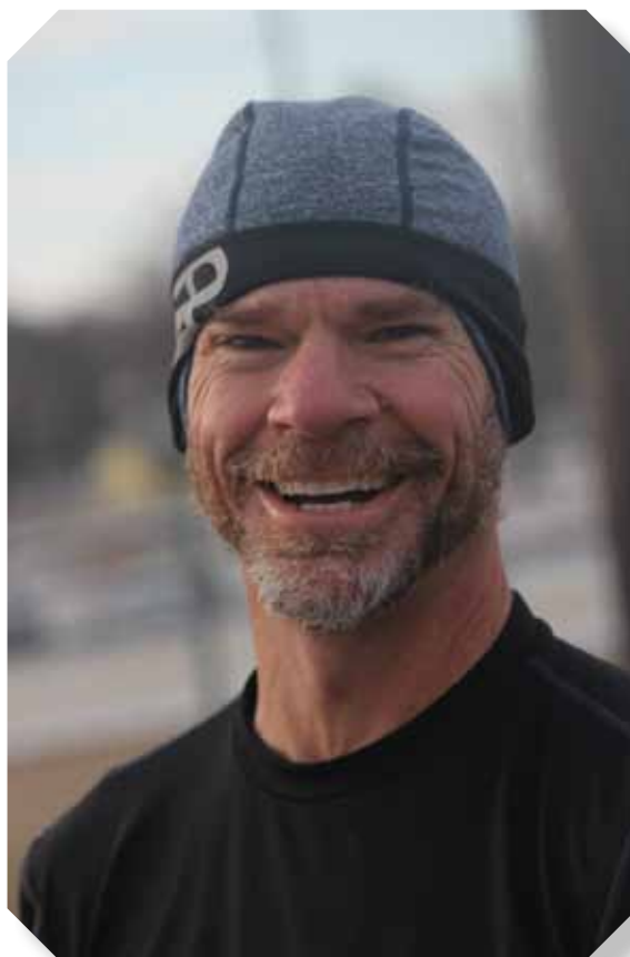
Will he be this Happy After the Race?