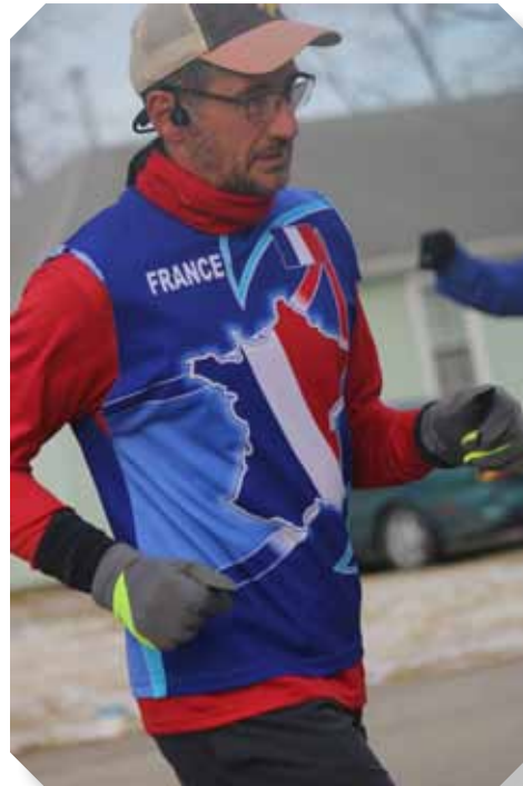
This Runner Traveled The Farthest to get Here "nothin' to it"