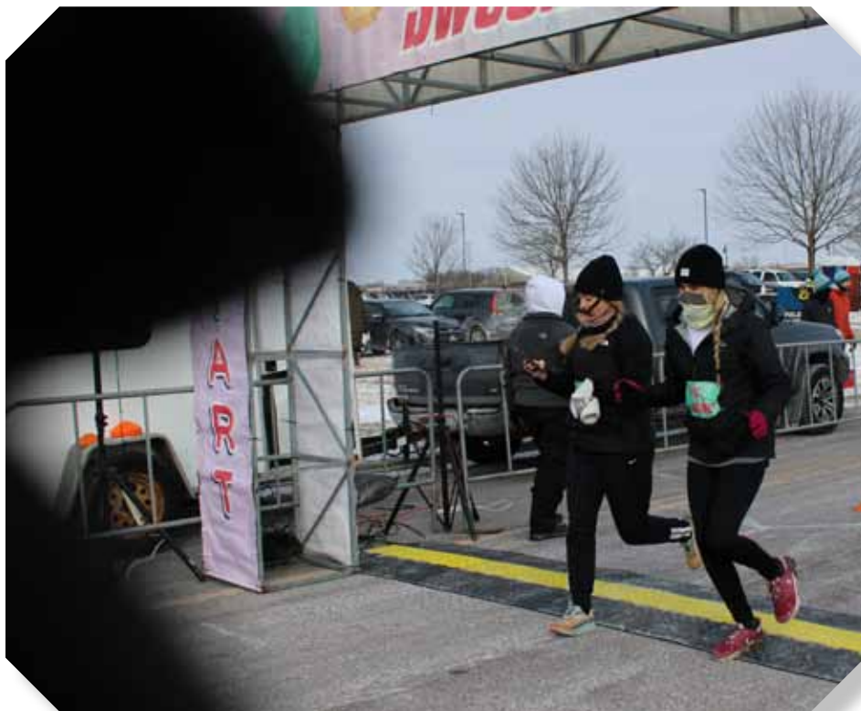
When Pigtails fly !