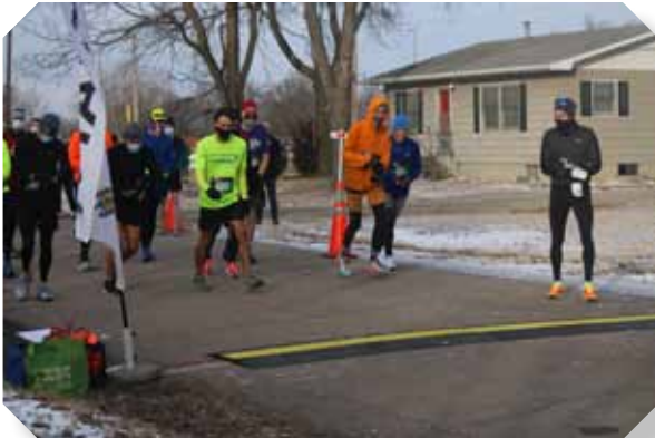
Relatively socially distanced start