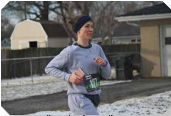
"Nothin' To It"