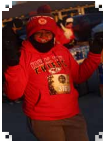
I'm 75 years old, and I'm working on a 330 day running streak!"