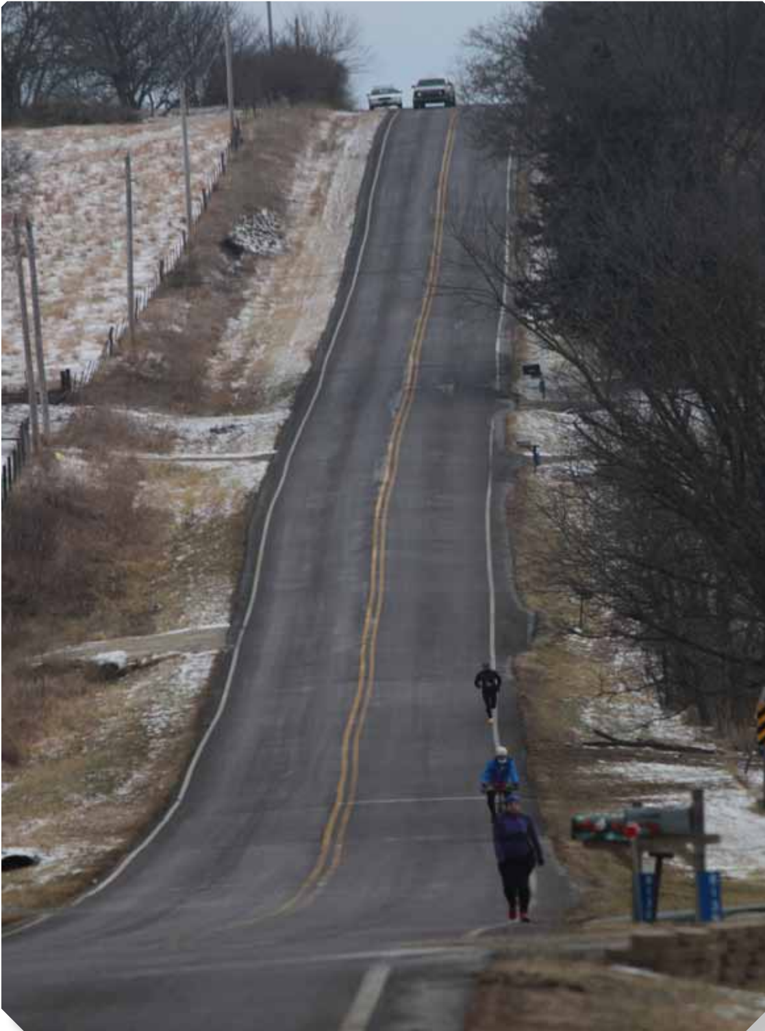
leader closing on a Walker Who had Turned Back