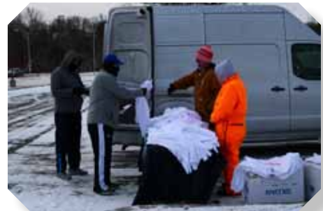
Sorting out the Shirts