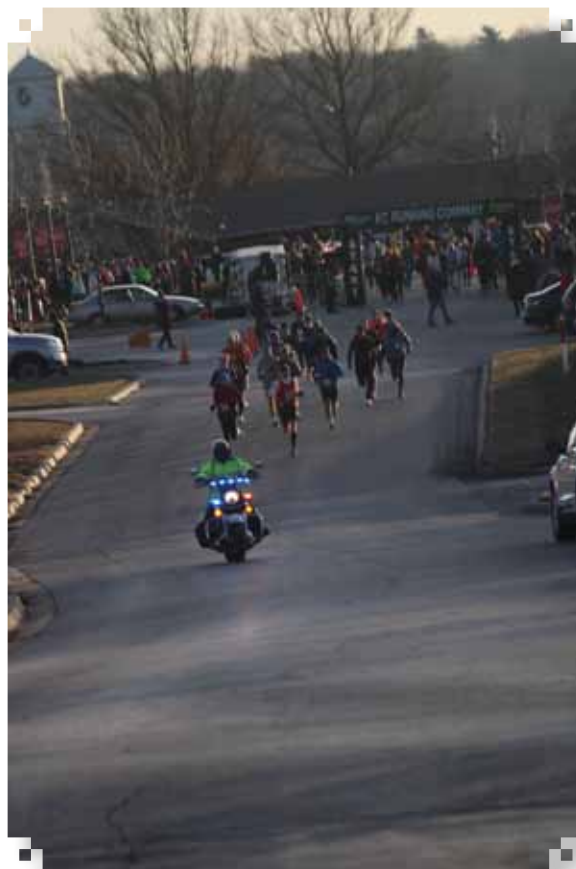
First Wave of 25 sets off