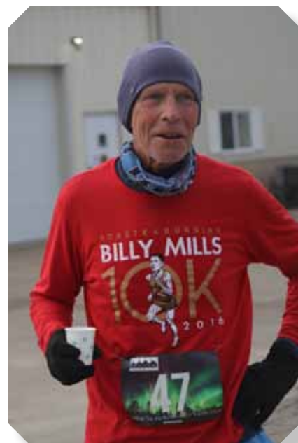
Run, Well Done!