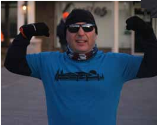
The Man Behind the Patriotic Mask