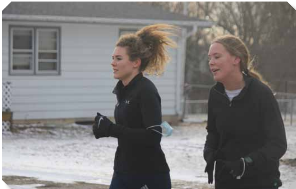
Running Support Buddies!