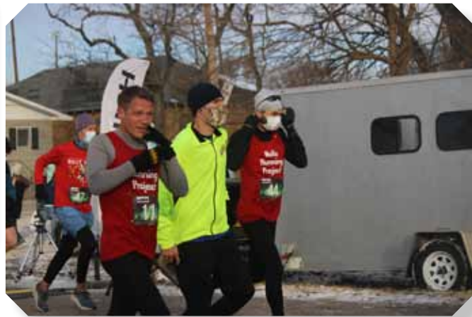
On their way!!