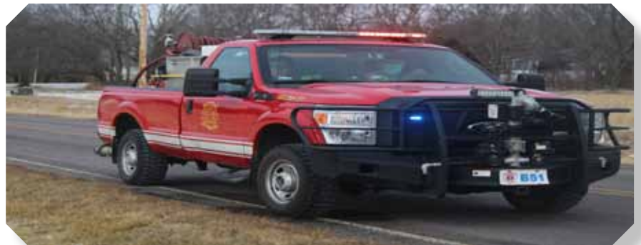
The Rescue Vehicle, its inhabitants worrying that an Old Photographer might need their services