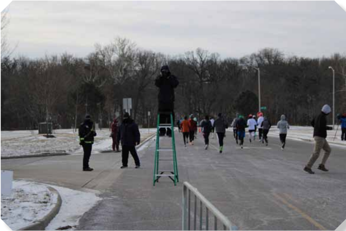
The First Group of Sweethearts