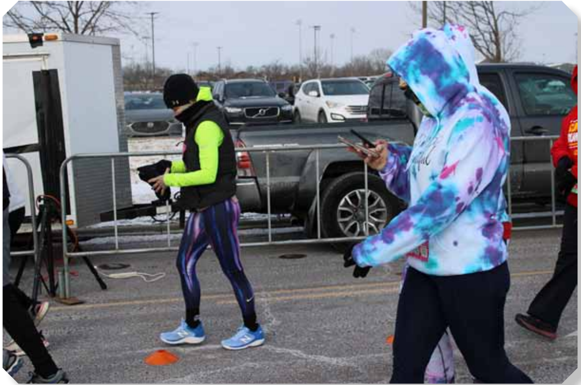
Already frozen Blue and Hasn't reached the Start