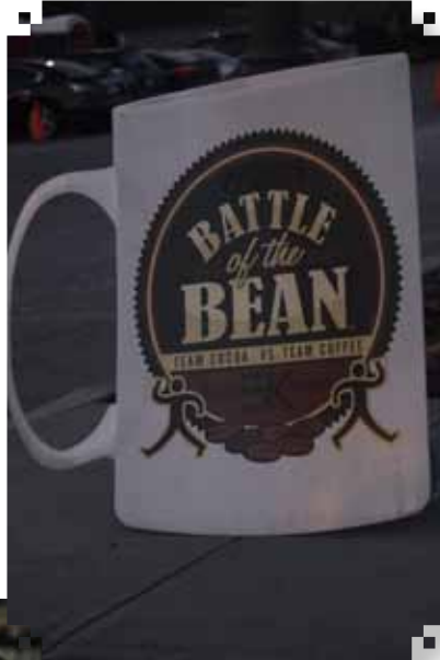
How can Team Cocoa lose?