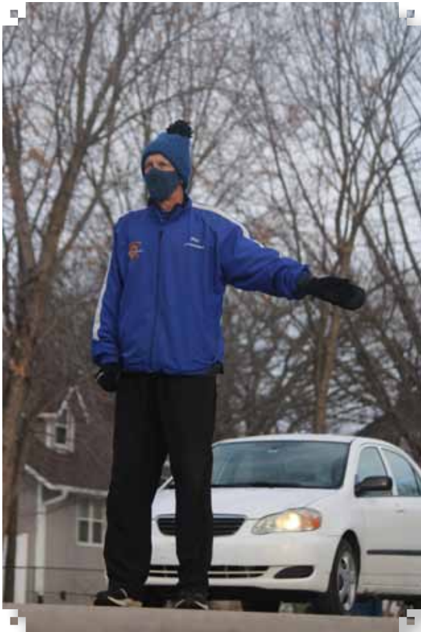
The Race Director Directing Runners