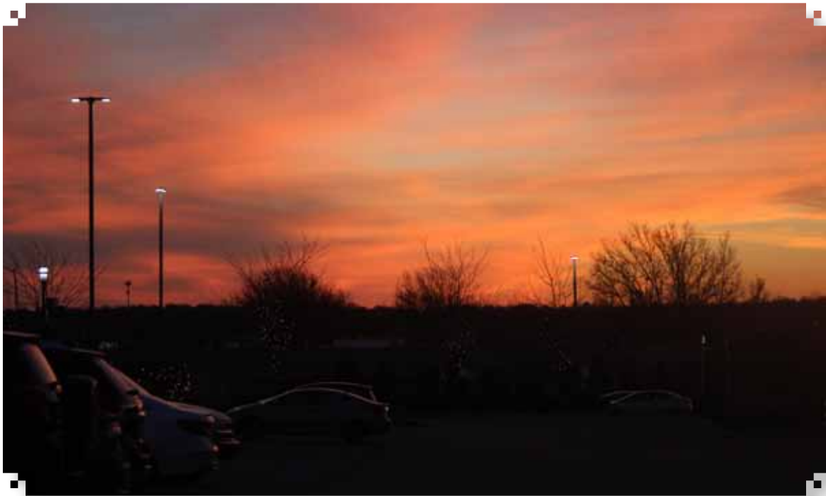
Red Bridge Sunrise