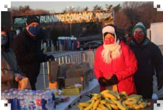
Going Bananas Before the race