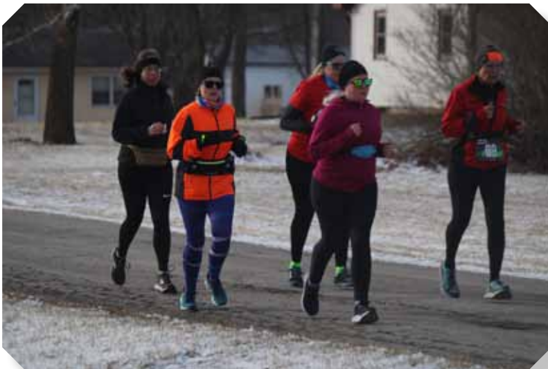
The final group of the field - The Ladies, Running and Walking at mile 4