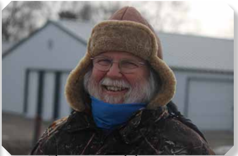
The community helps put on a great race!