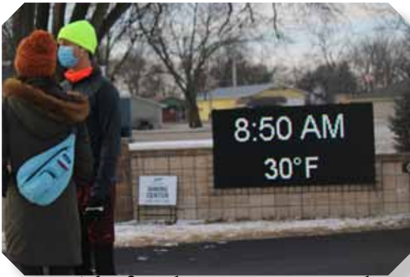
5771 The frigid race time approaches.