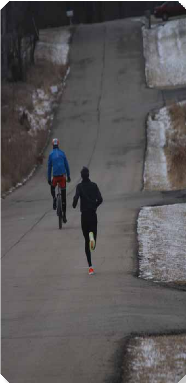
Pumping hard to stay ahead of the leader.