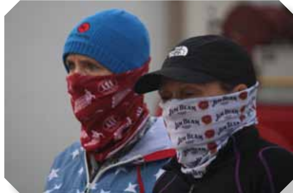
Few are willing to face the stern race director.