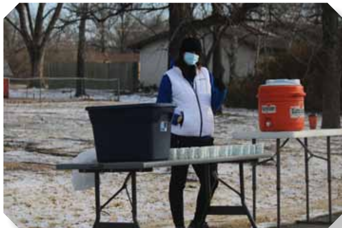
Leader of the Aid station -- Not Running ,Because of her Pregnancy