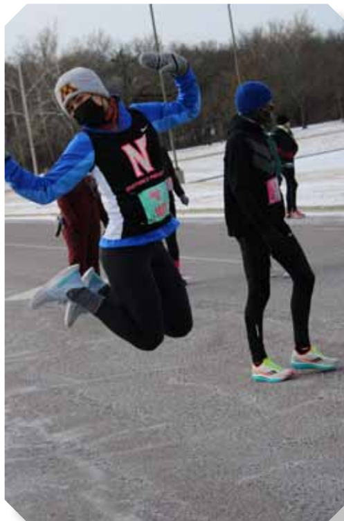
The Warmup Jump!